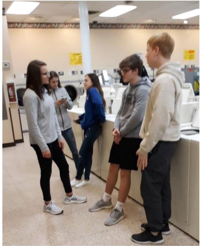
Waiting for clothes to dry while helping with Loads of Love!

your name on the list. You can check out our accommodations at http://www.whitelakechristiancamp.com/ . Under "Accommodations" go to "Lodge" and it will show you pictures of the lodge where our group will be staying. Believe me, you'll get way more out of this trip than you'll give!! If you haven't gone before, you need to!